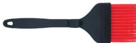
90249 - 7.5 cm High Heat Basting Brush